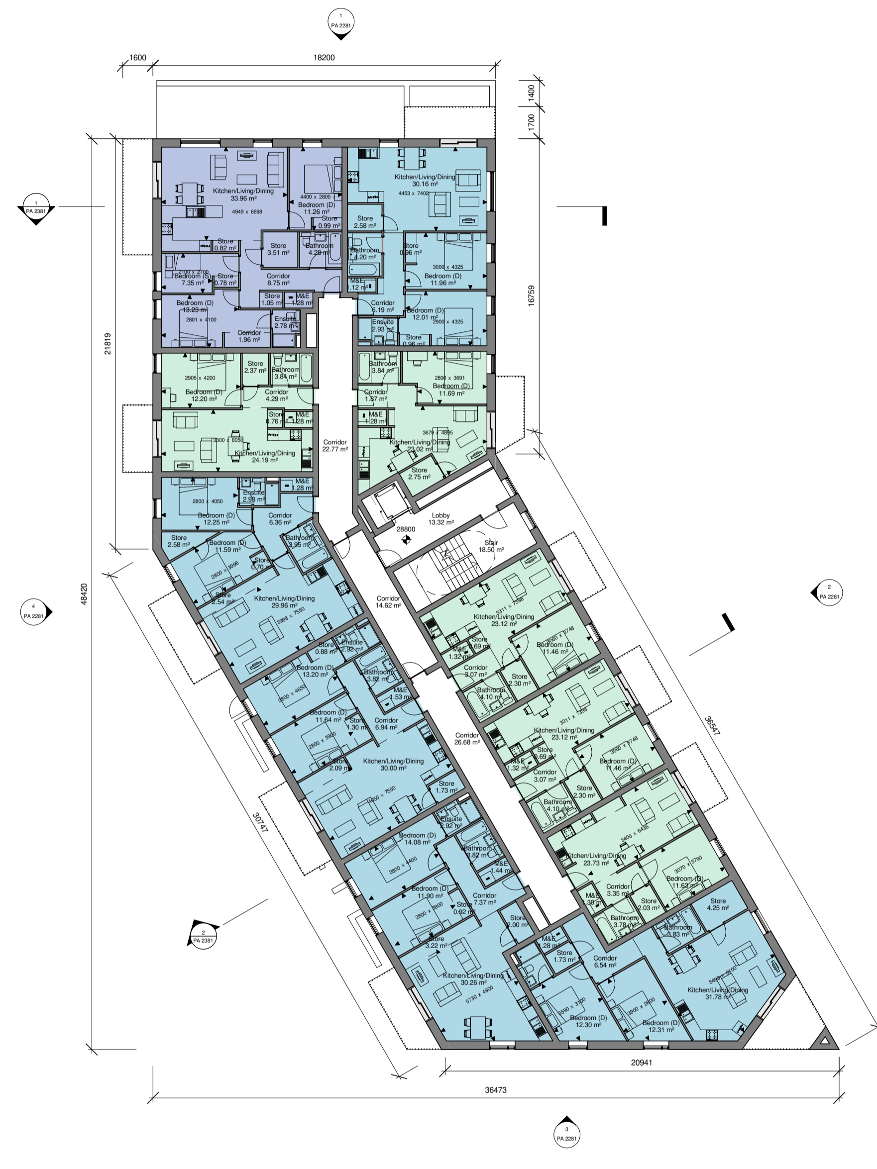
2 Block H - Level 01