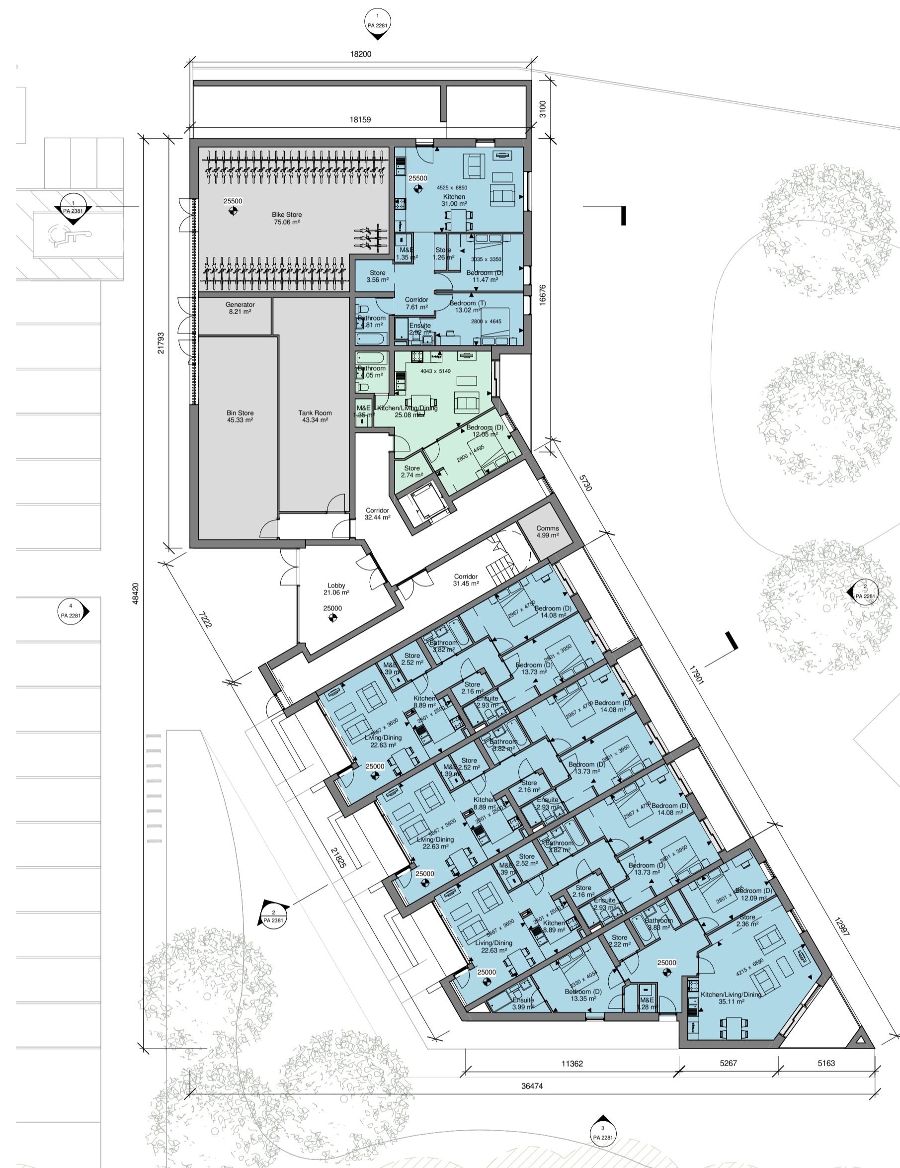
1 Block H - Level 00